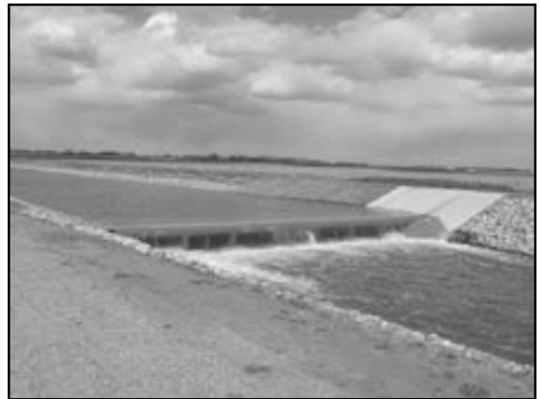
Flow measuring weir on A Canal

Sander says that SCADA installation will take place along with canal rehabilitation throughout the district over the next 10-15 years.