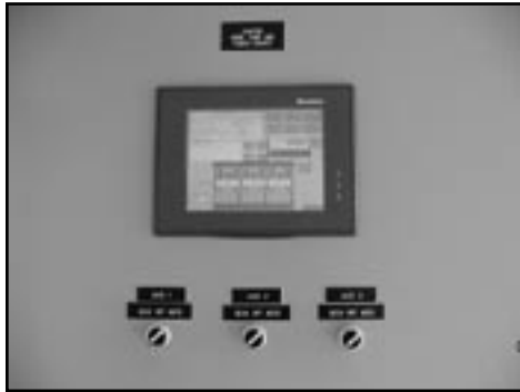
SCADA station at Chestermere

"Sometime next summer, we will get teachers together that cover more Grades, go through the material and teacher's guide and begin to broaden where else they can use it." If you want to look at the material currently available, visit www.everydropcounts.com