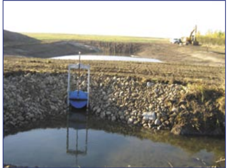
Graham Jackson dugout after construction

very good to work with. The fellows that came out to do the work were very professional and did a good job. I would suggest that anyone get involved in this sort of project. We all know that conserving water is a big focal point with government and the public," he says. The Board feels that the dugout projects